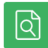
Site Analytics / SEO